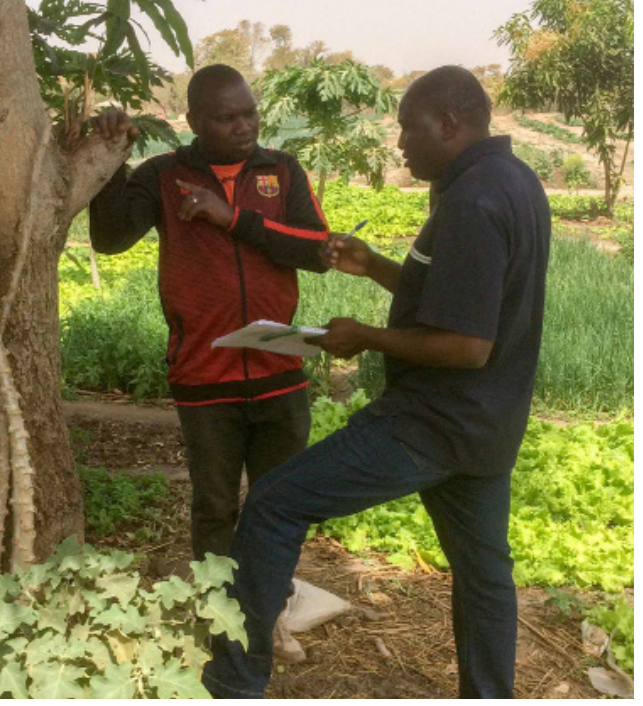
MIT D-Lab partner conducting interview in Mali.

The resulting library of hundreds of indicators measure the social, environmental, and economic elements of sustainability with a focus on rural communities. COSA's indicators are formulated carefully to comply with a number of SMART criteria (Specific, Measurable, Achievable, Realistic, and Trackable), so that they are practical to use and provide actionable information.