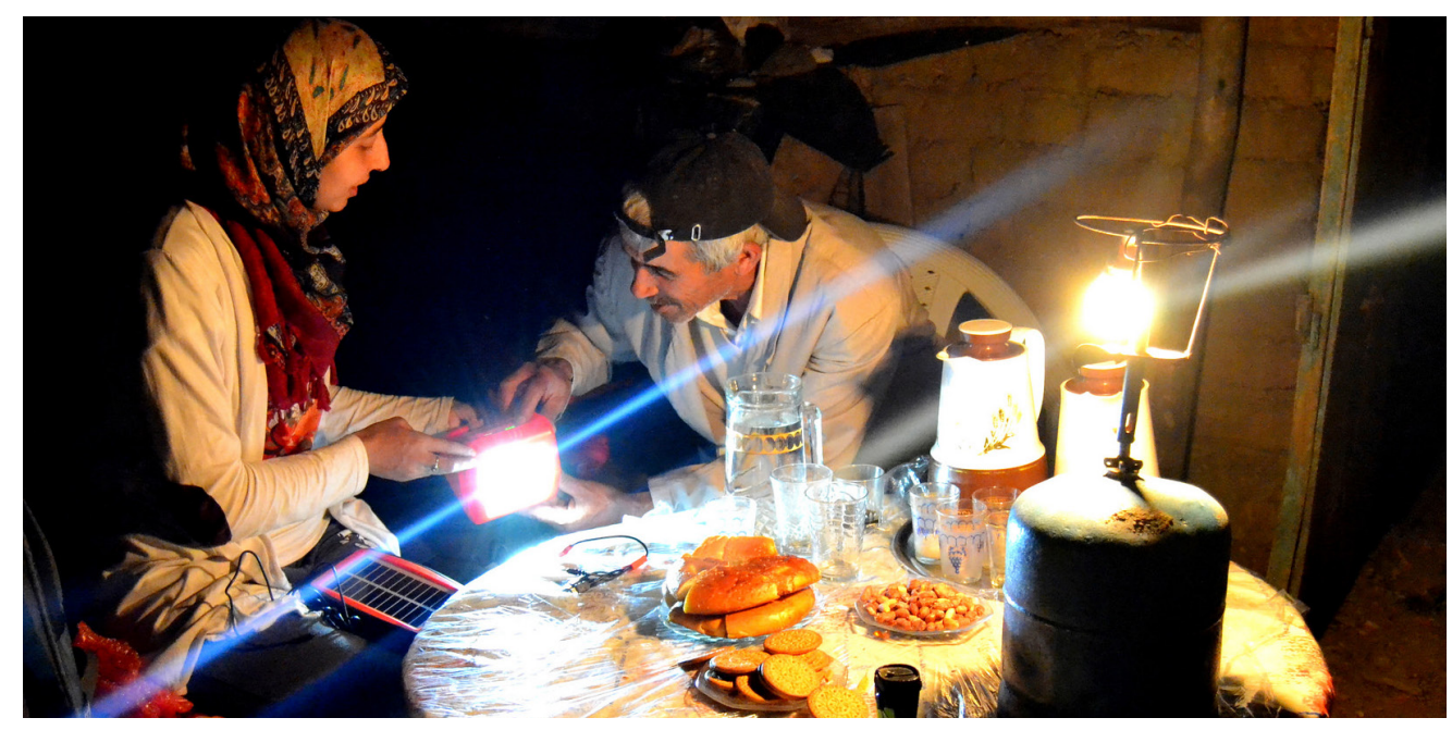
MIT D-Lab solar lighting technology evaluation, Morocco.

Although the Lean Research principles should be integrated throughout each phase of research, it is particularly important that they be established in the design and planning phase.