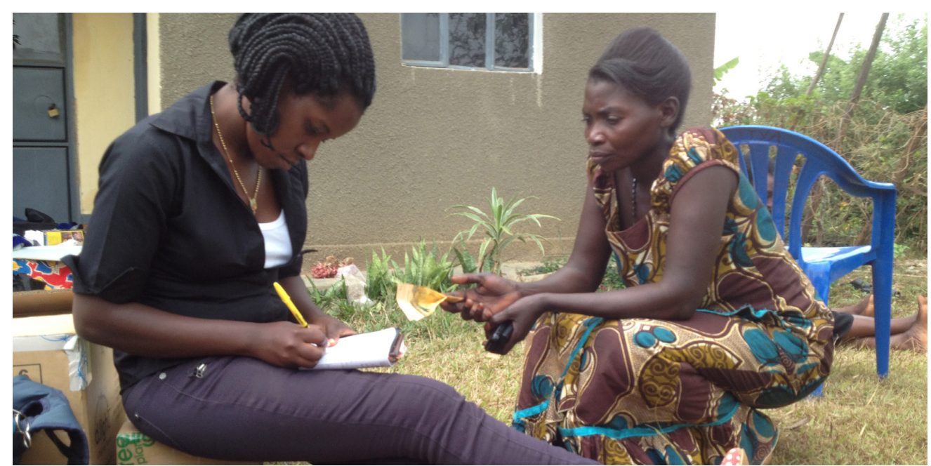
Agricultural waste charcoal briquette user research study, Soroti, Uganda, MIT D-Lab.