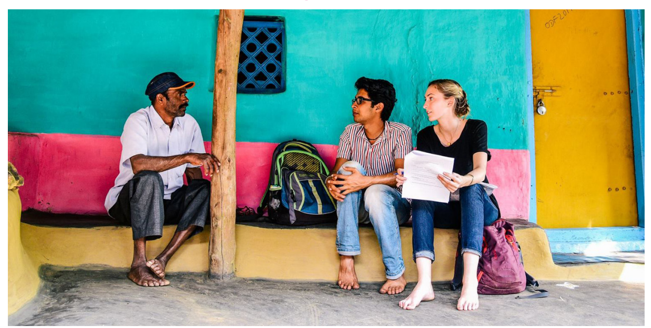
MIT D-Lab xylem water filter research in Uttarakhand, India.