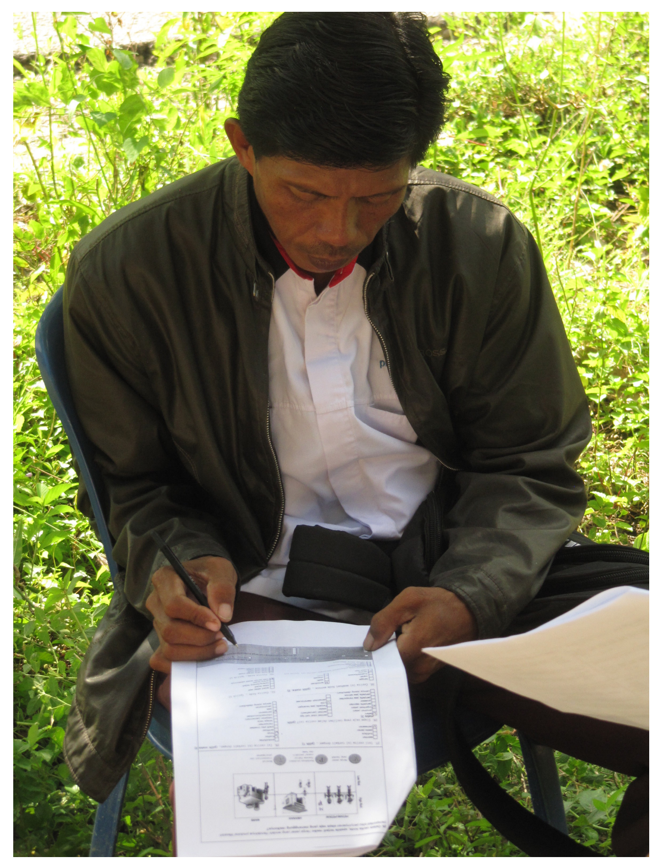
An Indonesian cocoa farmer interprets his own story using the SenseMaker-based Inclusive Business Scan.