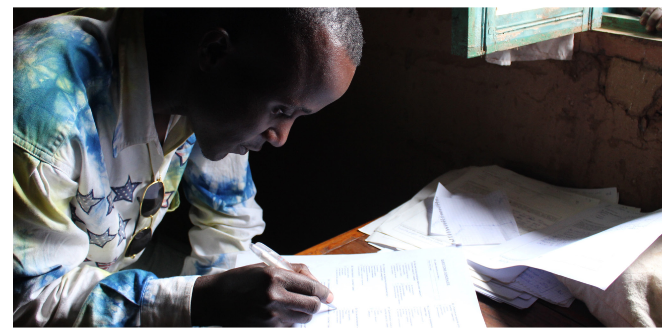
A coffee farmer in DR Congo interprets his experience of selling coffee through the Kawa Kabuya Cooperative.