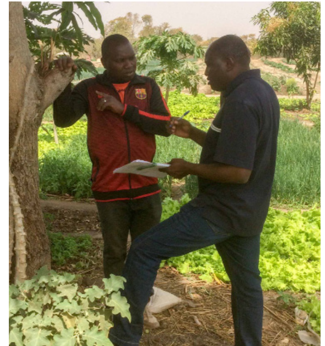
MIT D-Lab partner conducting interview in Mali.

The resulting library of hundreds of indicators measure the social, environmental, and economic elements of sustainability with a focus on rural communities. COSA's indicators are formulated carefully to comply with a number of SMART criteria (Specific, Measurable, Achievable, Realistic, and Trackable), so that they are practical to use and provide actionable information.