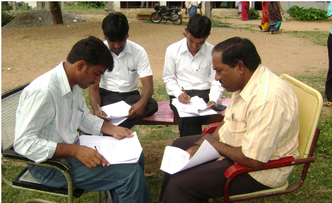
Research project in Andhra Pradesh, India.

When working with enumerators and interpreters, Tufts University has a conversation beforehand asking about their goals and why they are involved in the research. They also ask about what aspects of the research they find most exciting and which aspects they find less interesting, difficult, or potentially risky. This helps inform both the research and the understanding of their experience.