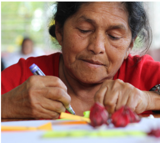
MIT D-Lab workshop participant, Estelí, Nicaragua.