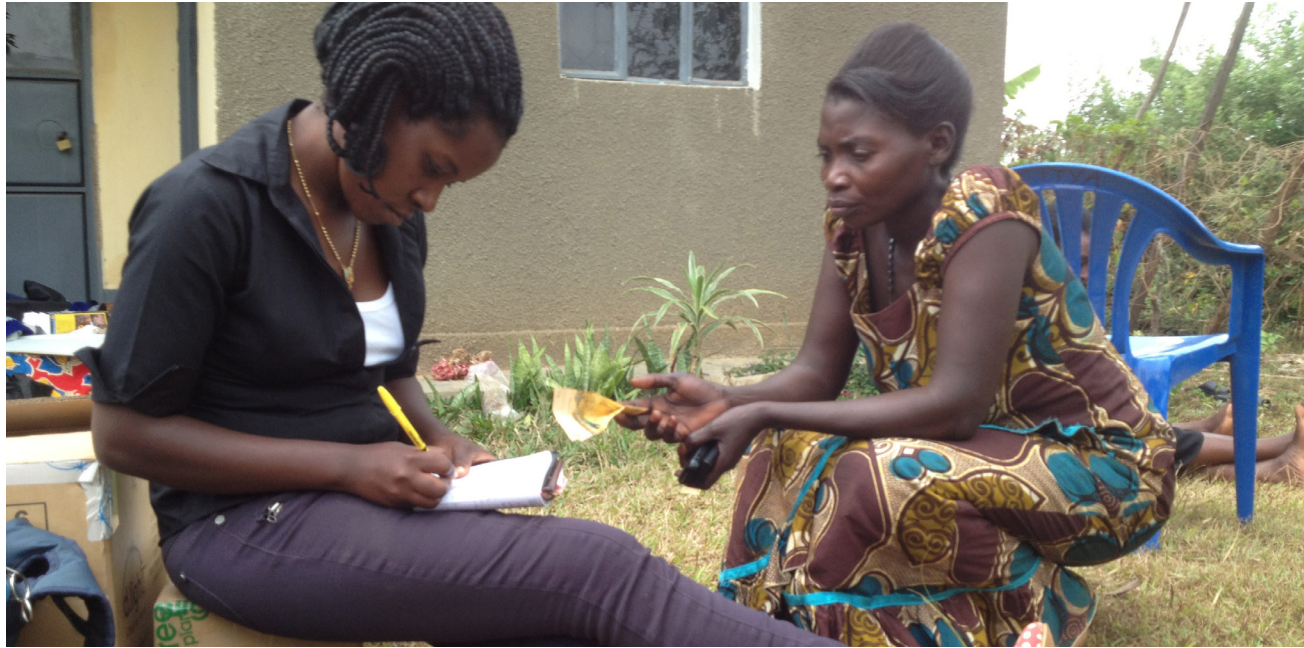
Agricultural waste charcoal briquette user research study, Soroti, Uganda, MIT D-Lab.