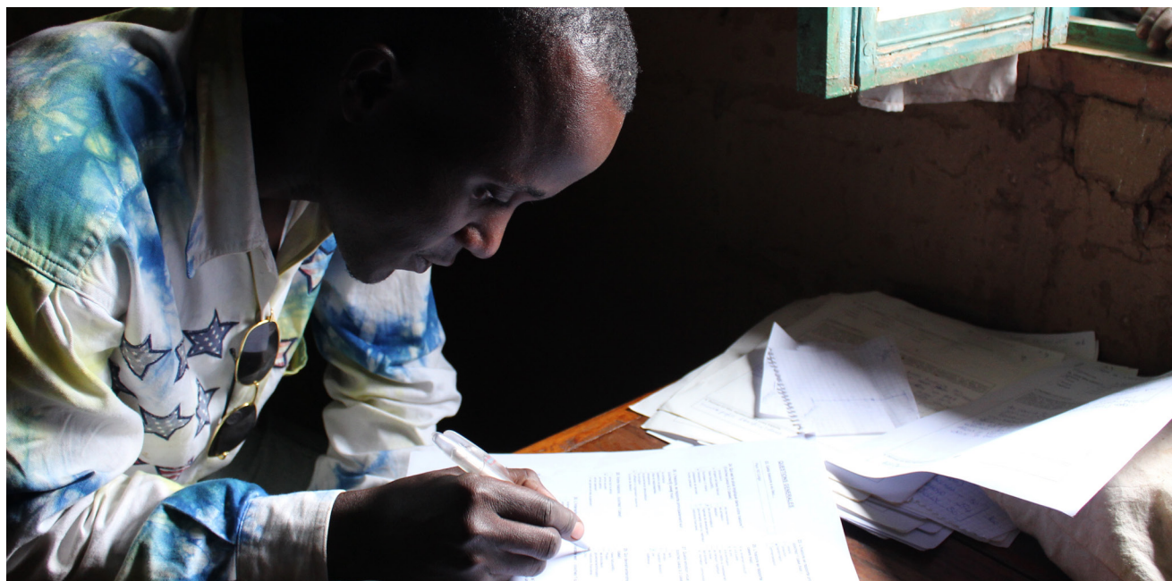
A coffee farmer in DR Congo interprets his experience of selling coffee through the Kawa Kabuya Cooperative.