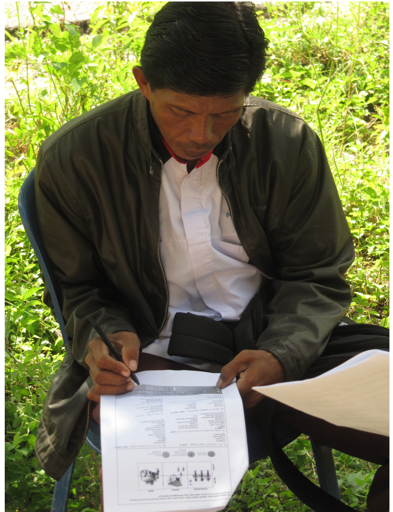
An Indonesian cocoa farmer interprets his own story using the SenseMaker-based Inclusive Business Scan.