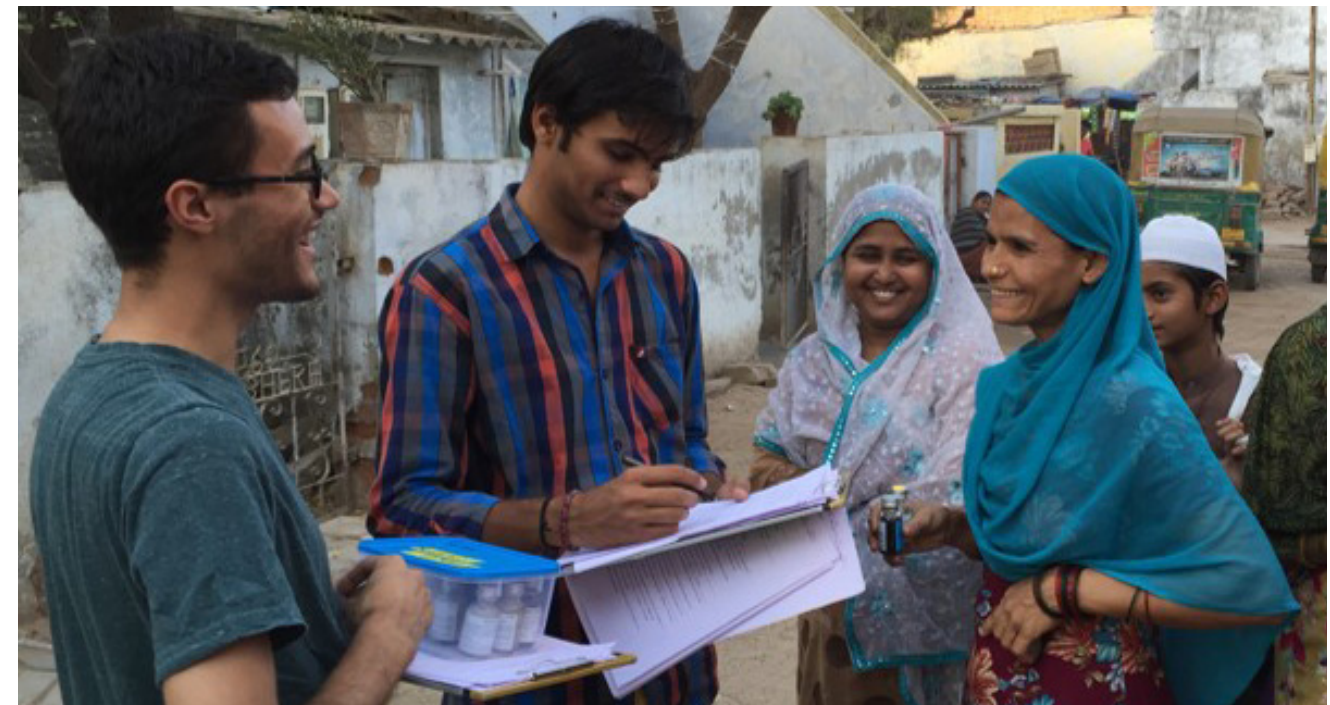
Water filter research, India.

After going over all points, the researchers explained to refugees how the information may be used in the future (media, publications, talks, etc.), asked them whether they still wanted their information to be included, and gave them their contact information in case research participants wanted to reach out in the future.