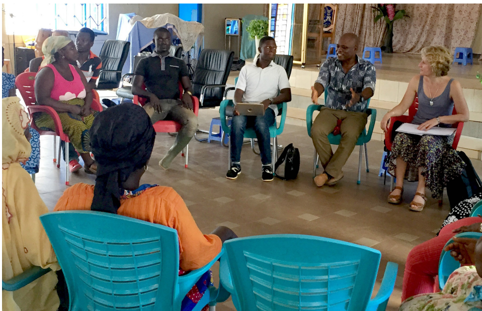
Research being conducted for a Living Income Benchmark Study, Ghana.

With regular reviews of simple-to-measure Key Performance Indicators (KPI) that anyone could check on, the relationship between the client firm and the producer community blossomed into one of deep trust, as each was able to see and maintain accountability for its commitment using tangible metrics rather than opinion or anecdote.