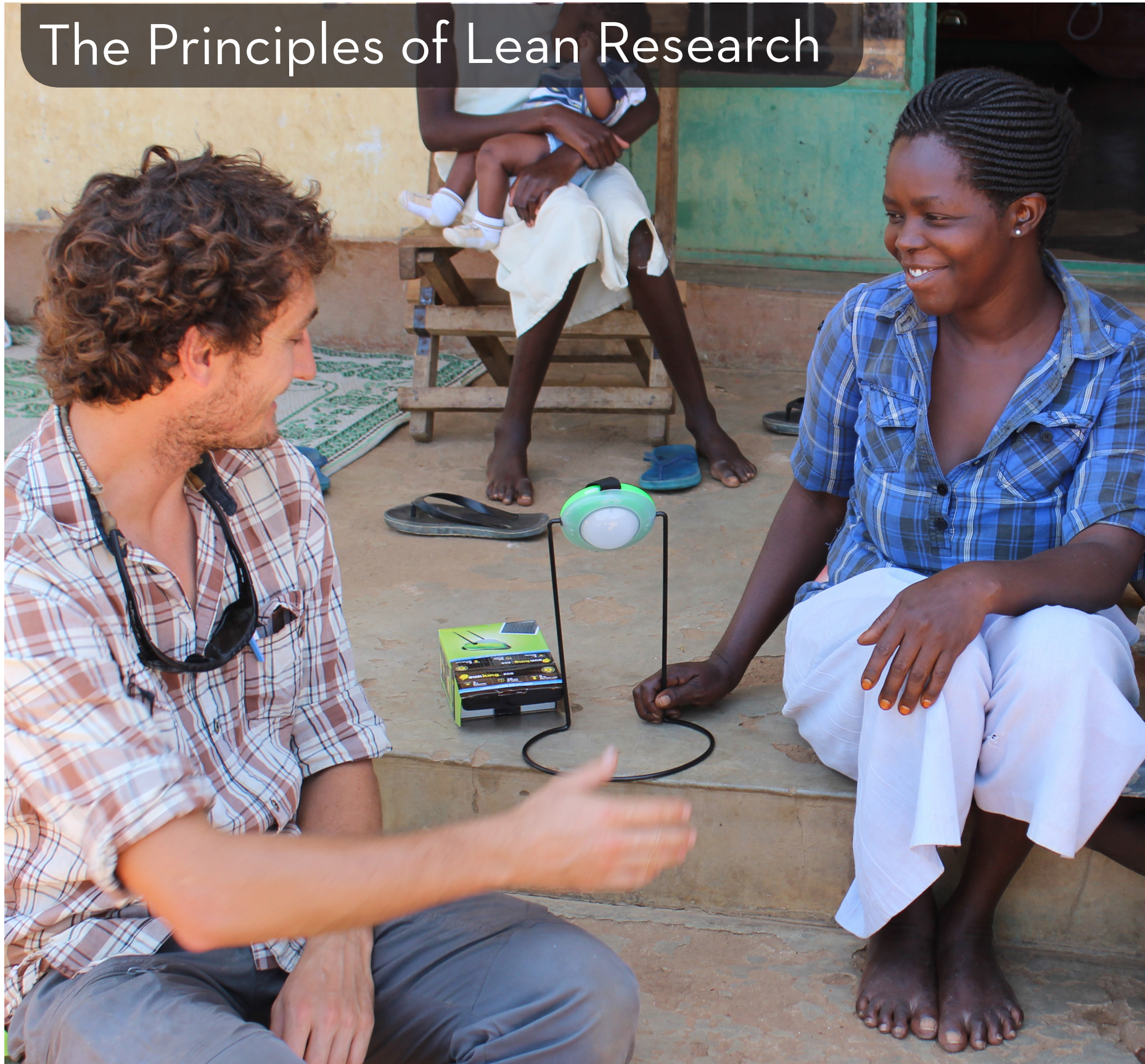
MIT D-Lab researcher explaining the objectives of a cookstove adoption study in Soroti, Uganda.

Lean Research does not provide a set of rules to follow, but rather encourages innovation and continual improvement in research practice. As described in the Lean Research Framework, Lean Research incorporates four principles, of rigor, respect, relevance, and right-sizing: