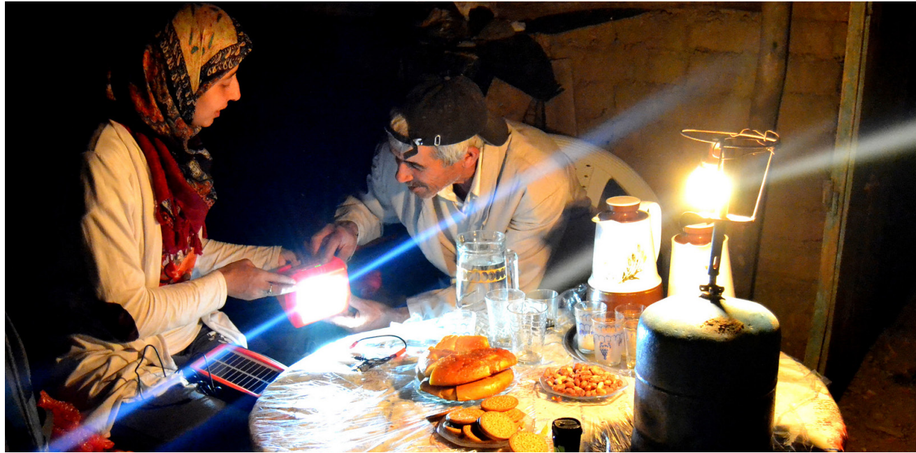
MIT D-Lab solar lighting technology evaluation, Morocco.

Although the Lean Research principles should be integrated throughout each phase of research, it is particularly important that they be established in the design and planning phase.