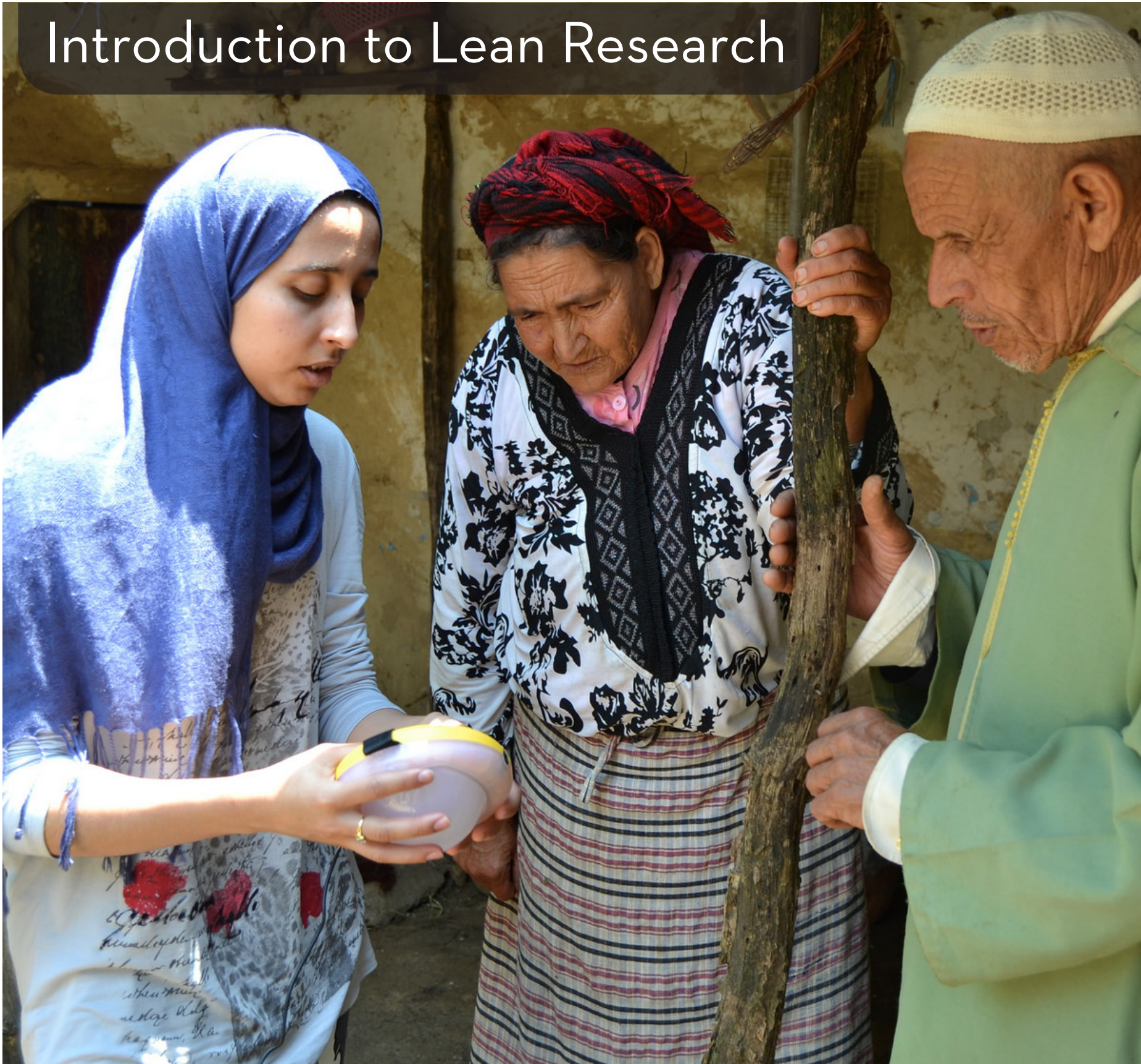
Researcher carrying out a solar light technology evaluation in Morocco.