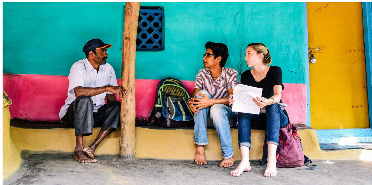
MIT D-Lab xylem water filter research in Uttarakhand, India.