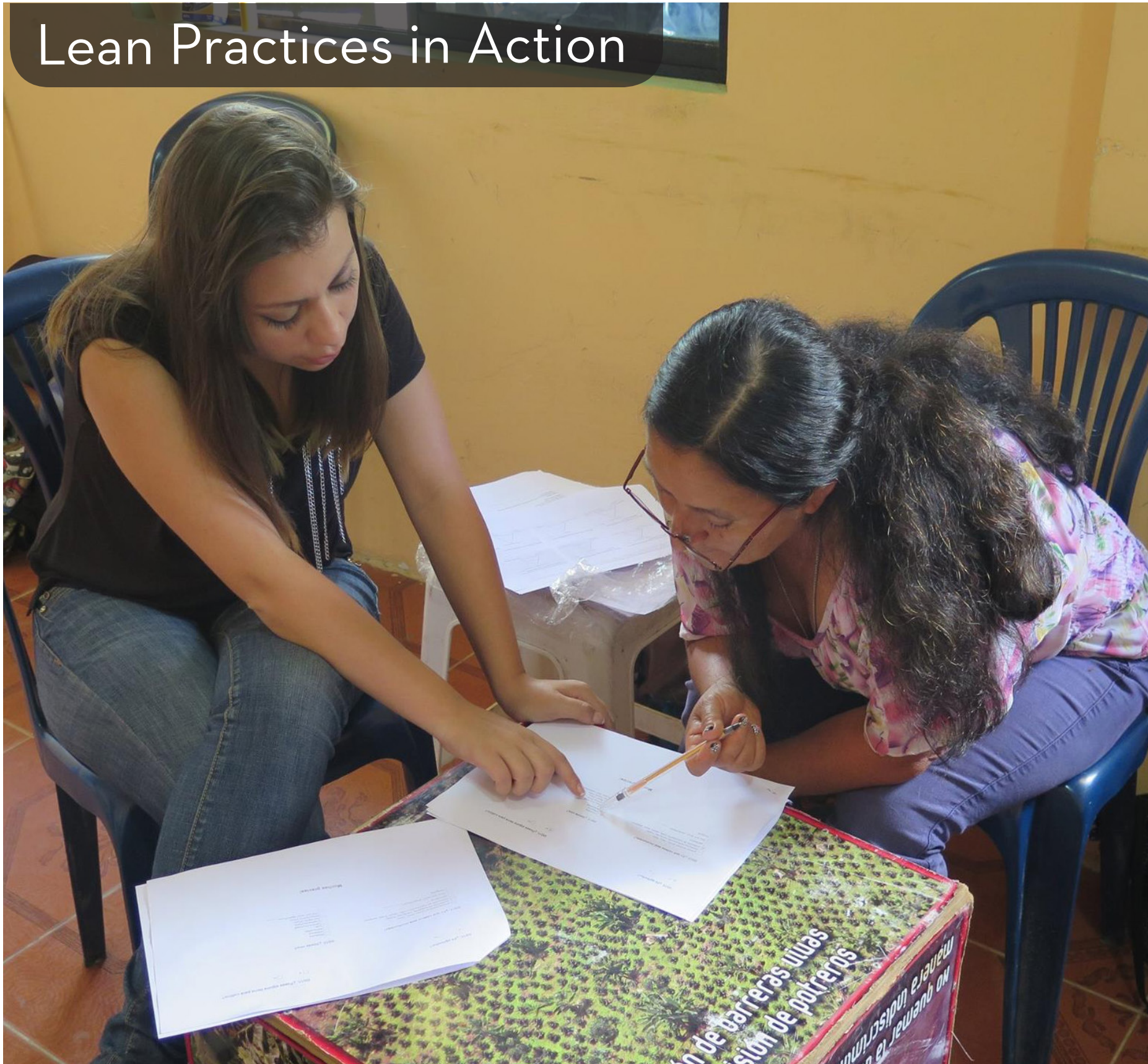
What do cocoa farmers from Nicaragua think about inclusive business partnerships? Helping cocoa farmer respondents to interpret their own stories is a key role of enumerators.