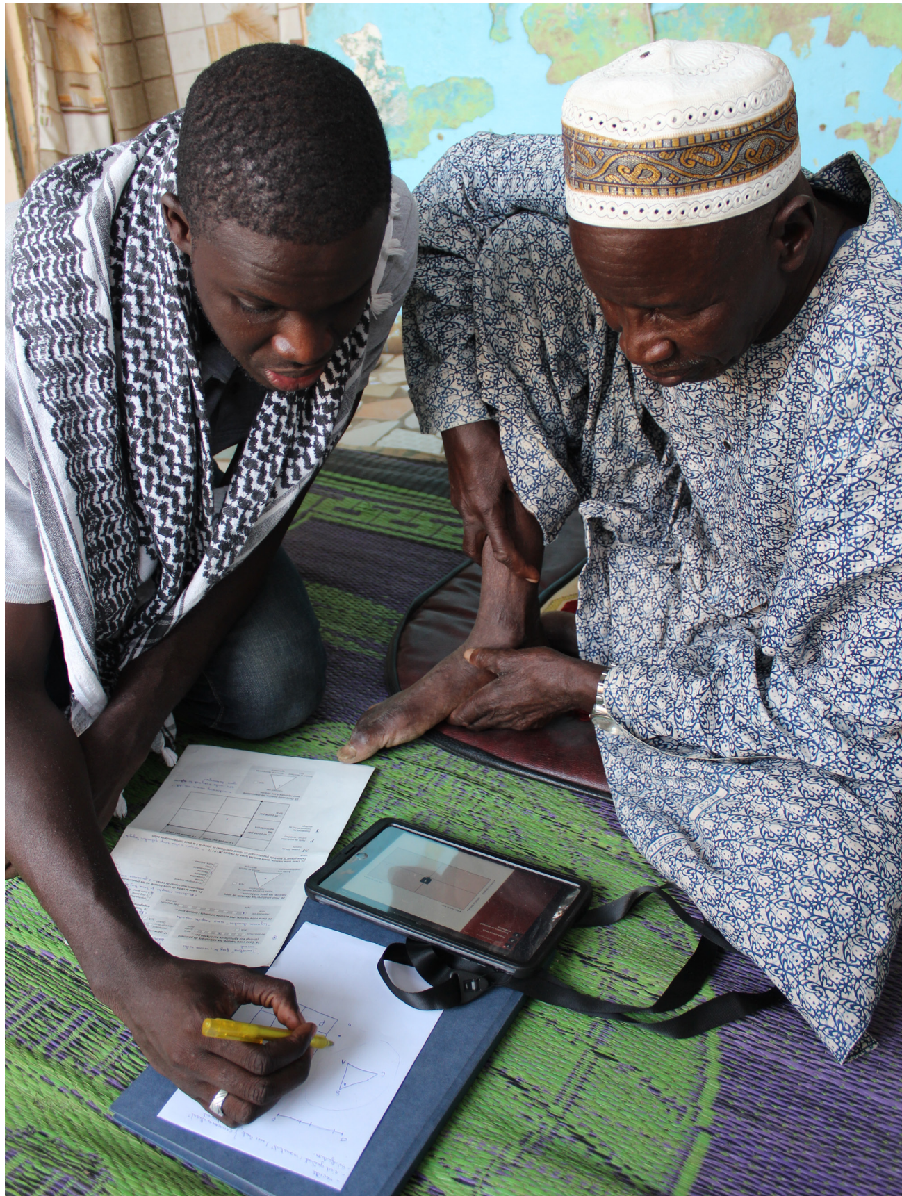
An enumerator explains the use of triads to help a Senegalese farmer self-interpret his story, using the Inclusive Business Scan.