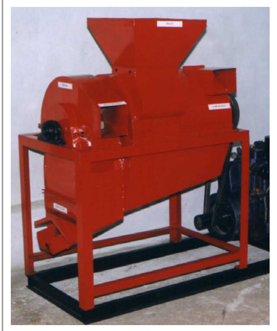
A mechanized corn sheller.