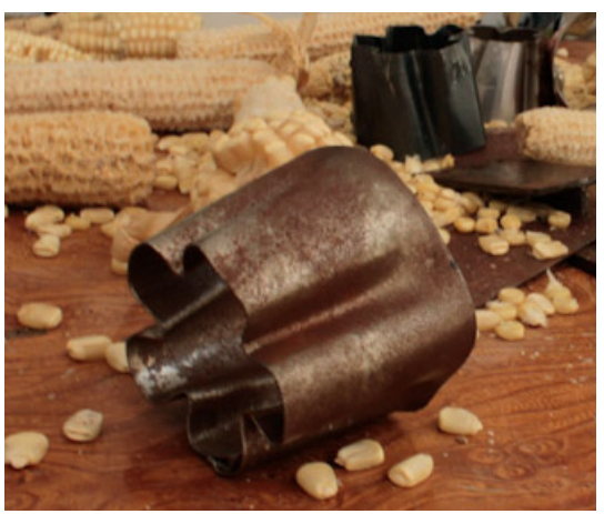
Sheet metal cornsheller and shelled corn.