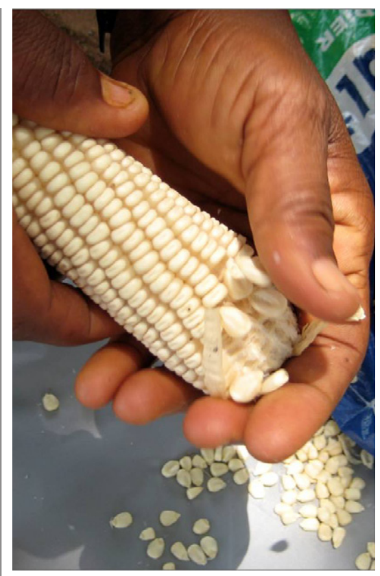
Shelling corn by hand.

Existing alternatives to shelling maize by hand are often unaffordable or difficult to obtain for subsistence farmers. An estimated 550 million small-holder farmers in the world lack access to mechanized agricultural technology. Industrial maize shellers are prohibitively expensive, with a cost range of US$1,200-1,800; small-scale hand-cranked or pedal-powered maize shellers cost US$20-50, which is still more than many families can afford. While industrial shellers are highly productive, their energy infrastructure requirements can render them unusable in rural villages. Furthermore, mechanized equipment and stationary pedal-powered devices are difficult to transport to the users. As a consequence, farmers may be required to travel long distances to process their crops or the technology may not be able to reach the communities who need it most.