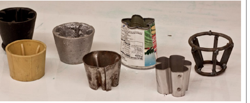
Varieties of corn shellers using different materials and methods.

These materials are provided under the Attribution-Non-Commercial 3.0Creative Commons License, http://creativecommons.org/licenses/by-nc/3.0/. If you choose to reuse or repost the materials, you must give proper attribution to MIT, and you must include a copy of the noncommercial Creative Commons license, or a reasonable link to its url with every copy of the MIT materials or the derivative work you create from it.