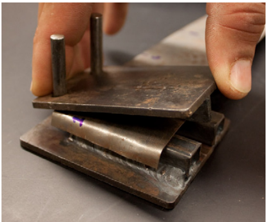
Sheet metal corn sheller forming jig.

Please use the following citation format: D-Lab Corn Sheller Background Copyright © Massachusetts Institute BY NC SA of Technology (Accessed on [insert date]).