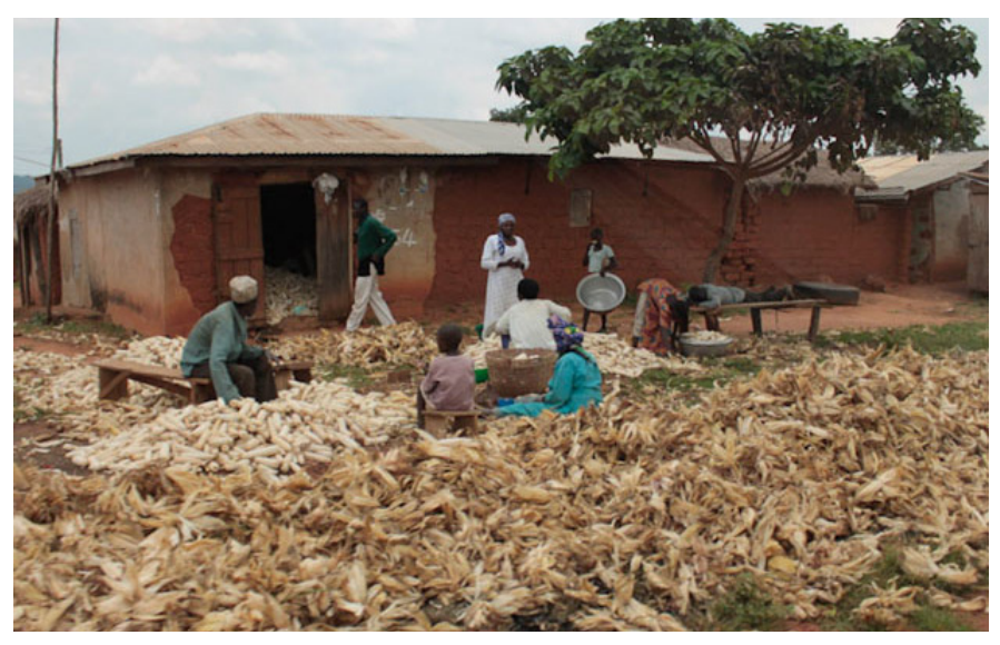
Shucking and shelling corn in rural Ghana.

Maize (corn) is one of the most important staple crops in the world. In Kenya, for example, 45% of the population considers Ugali (maize meal) to be their survival food, making it the most consumed food of the country. Maize also accounts for 43% of the Latin American diet. In Asia, maize production is over 200 billion kilograms a year and it is expected that the total maize production in developing countries will eventually overtake production in industrialized countries.